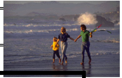
Accepting God's Grace