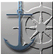
CHART YOUR COURSE