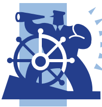
CHART YOUR COURSE

Christian Church of God 801 Quail Creek Drive Amarillo, Texas 79124