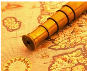
CHART YOUR COURSE

Christian Church of God 801 Quail Creek Drive Amarillo, Texas 79124