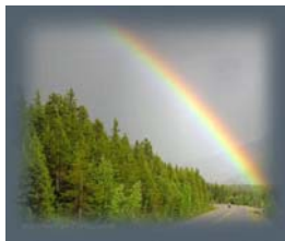
CHART YOUR COURSE